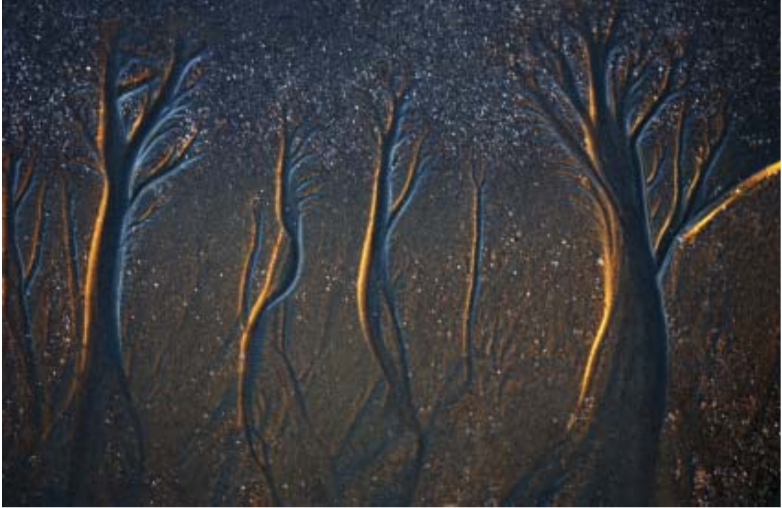
above: Ladies Dancers , 2006.