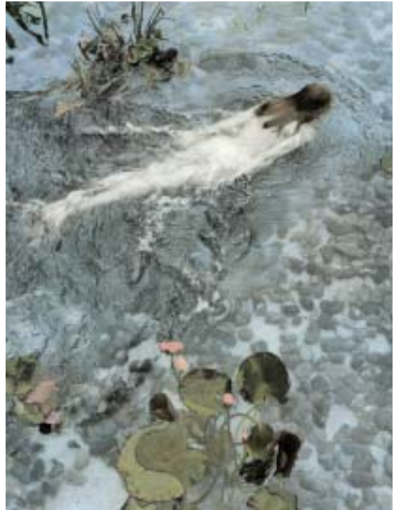
The Magical Lagoon, 1990.