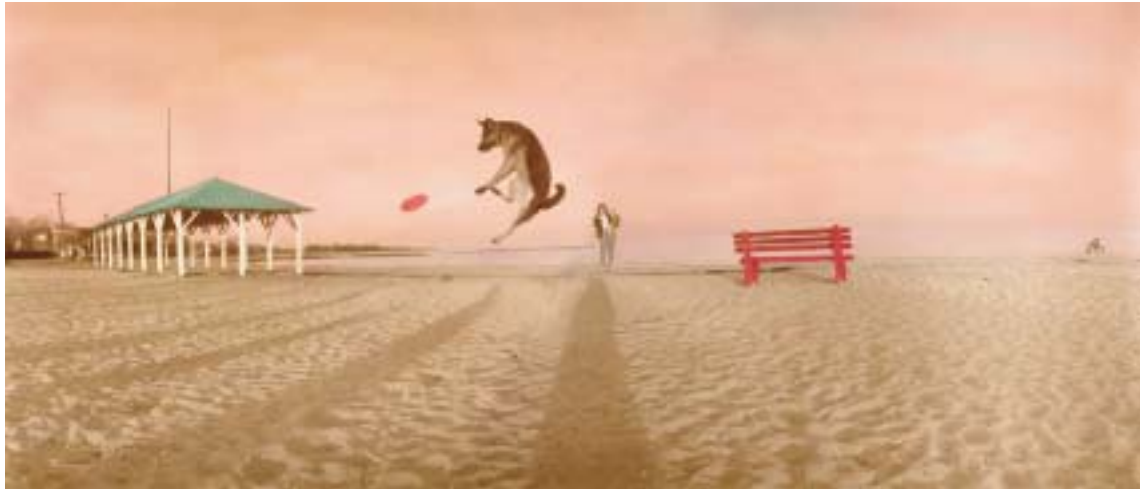
Who Threw the Dog, 1988.