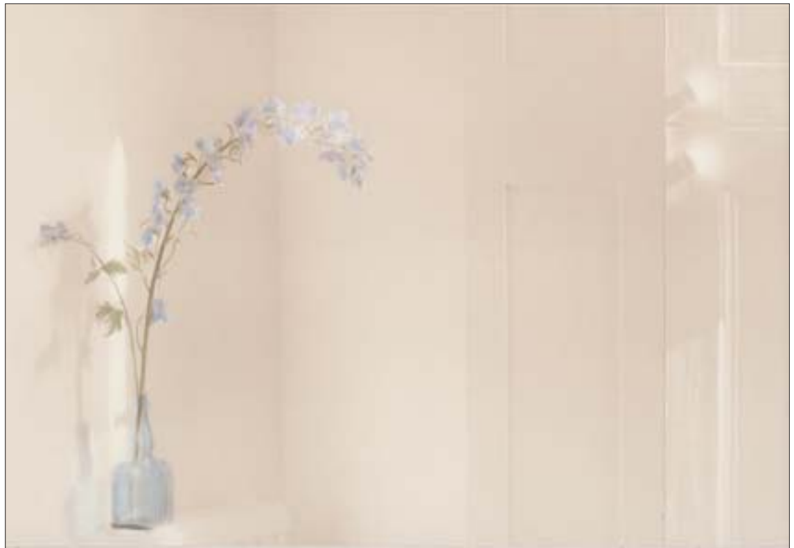
About Light, 1989.