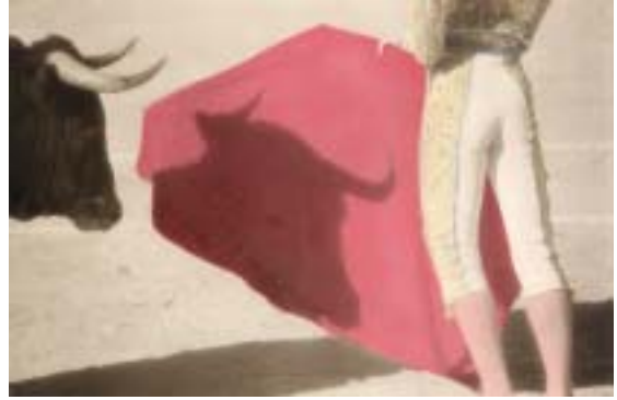
Dance With the Matador, #3, 1984.