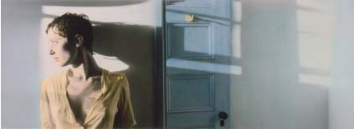
Look to the Light, 1996.