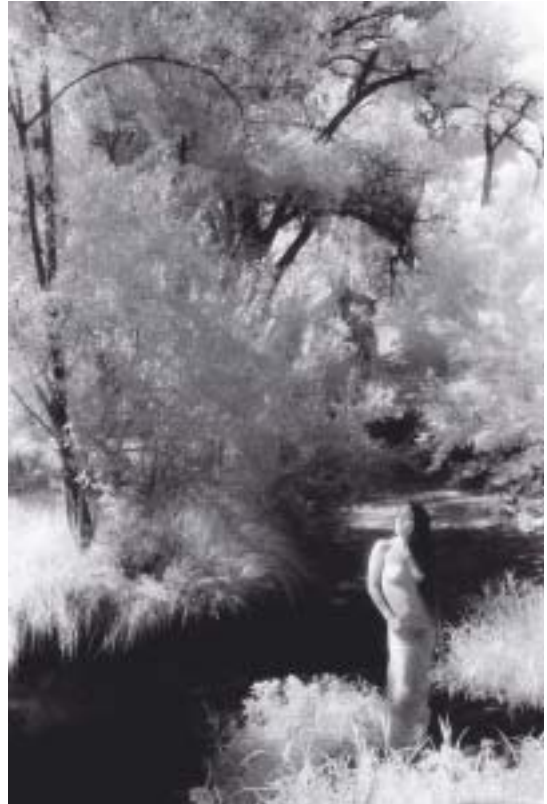
above, left: Embrace Yourself, 1997 (Mordançage); above, right: Los Luceros, 1999 (Infra-red).

“What takes time to create, time respects.”