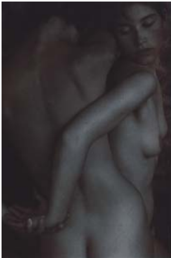
The Embrace , 1994).

other side of the circle, I acquire the Nancy Lopez Golf campaign and barge the rivers of Holland and Germany on another assignment.