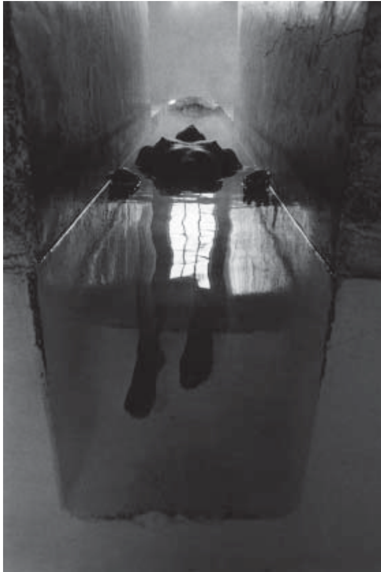
Outer Light, Inner Peace, 2003.