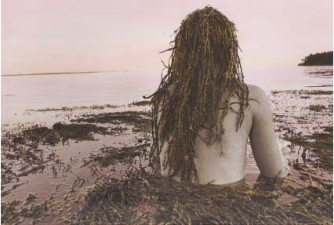
Distant Horizon, 1980.